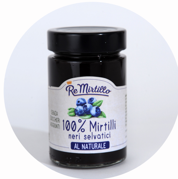
CODE : CF0005 100% Natural wild blueberries Gr.200