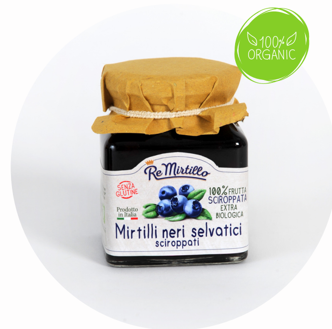
CODE : CF0010 Natural wild blueberries in syrup Gr.340