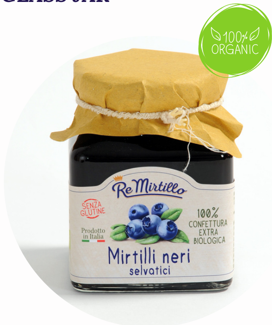
CODE : CF0001 Extra jam Wild blueberries Gr.340