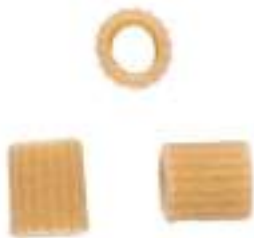
DITALI RIGATI n.83