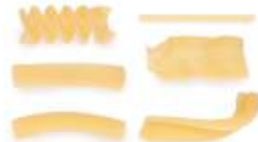
PASTA MISTA n.39