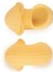
LUMACHE RIGATE n.34