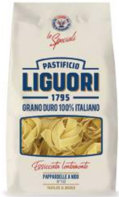
PAPPARDELLE A NIDO n. 132