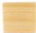
MEZZI PACCHERI RIGATI n.128