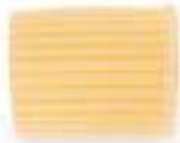
MEZZI RIGATONI n.38