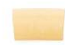
PACCHERI DI GRAGNANO n.209