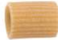
MEZZI RIGATONI n.38