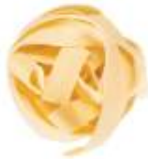
PAPPARDELLE A NIDO n.205