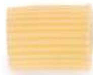
MEZZI RIGATONI n.38