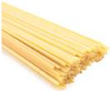
SPAGHETTI ALLA CHITARRA n.5