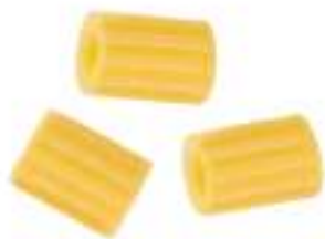
DITALI RIGATI n.83