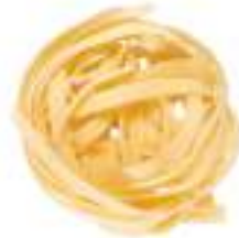
FETTUCCHINE A NIDO n.206