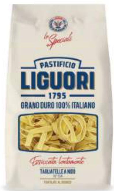
TAGLIATELLE A NIDO n. 134