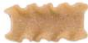
MAFALDE CORTE n.51