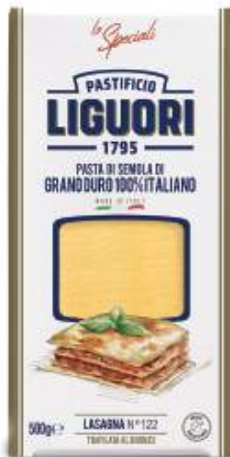
LASAGNA n. 122