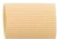
PACCHERI RIGATI n.127