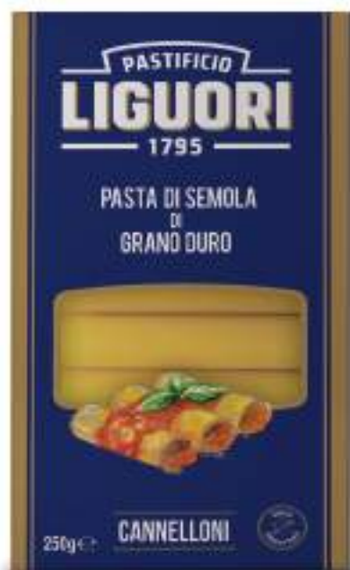
CANNELLONI n. 134