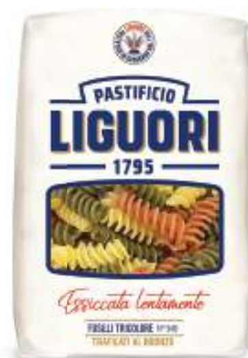
FUSILLI TRICOLORE n. 340