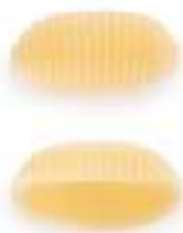
GNOCCHI SARDI n.33