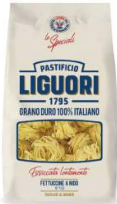
FETTUCCINE A NIDO n. 133