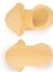
LUMACHE RIGATE n.34